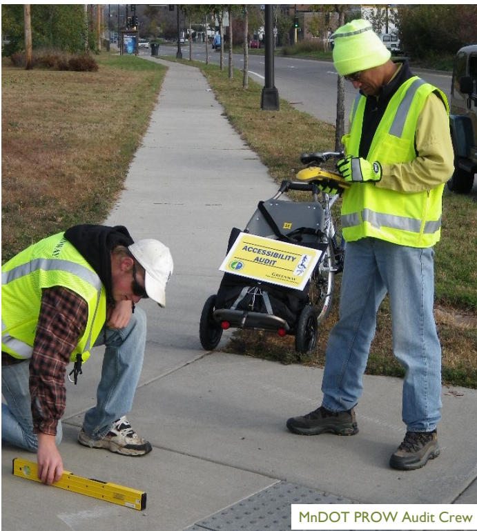
MnDOT PROW Audit Crew