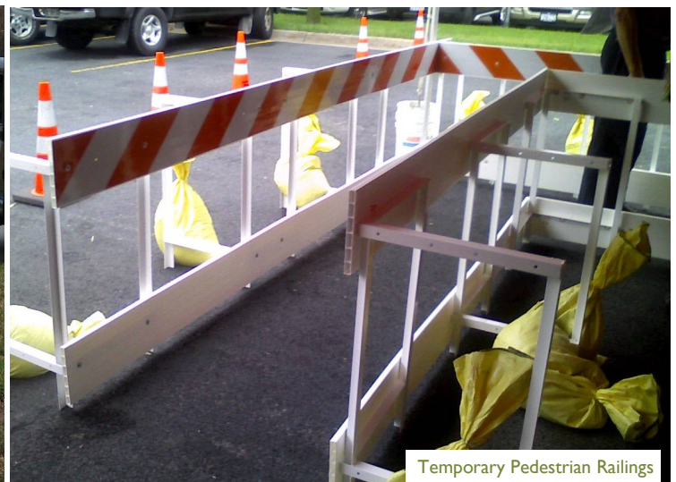
Temporary Pedestrian Railings