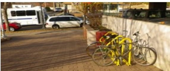
West Side Circulator Service

The study compiled a baseline transportation database of transportation and organizational maps and a undertook a preliminary review of the transportation options available at the various sites. We developed criteria and applied them to rate the accessibility of the program sites via various transportation modes. This was followed by a detailed investigation of the accessibility of 6 representative sites. Based on the findings, recommendations to improve access via walking, biking, and transit were developed. In addition the study also looked at the neighborhood circulator operation and identified measures to improve operation and reduce costs. The governing strategy of the travel plan is facilitate and encourage independent travel where possible and provide motorized transportation where needed.