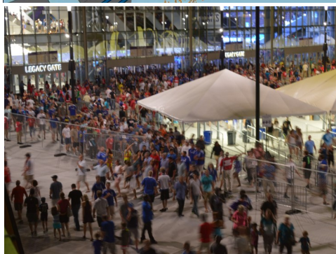
PS 105 Vikings

Greenway provided transportation planning advice for the $1 billion US Bank (Vikings) stadium, taking the lead in assessing pedestrian and vehicle circulation. Greenway worked with the HKS architects and urban designers to design the immediate area around the 65,500-seat stadium to make it a destination for both event and non-event days. We are carefully analyzing pedestrian and vehicle accommodation demand to make circulation safe and efficient. The result is a truly multi-modal transportation strategy that optimizes use of the light rail and other public transit, charter buses, bicycles and private cars. This will make a great experience for everyone who comes to the stadium, for whatever event.