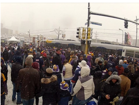
PS 105 Vikings